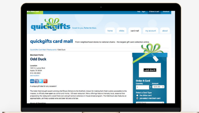
QuickGifts Card Mall (click image above for live example)