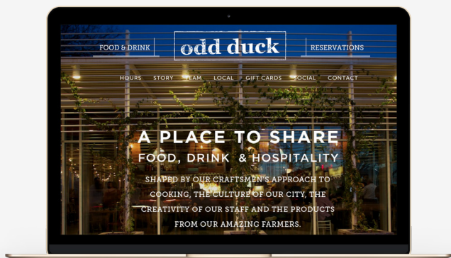
Your Website (click image above for live example)